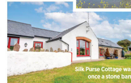
Silk Purse Cottage was once a stone barn

If you're looking to switch off from the everyday hustle and bustle, it doesn't get much better than Pembrokeshire in south-west Wales, 40 miles from Carmarthen and 60 miles from Swansea.