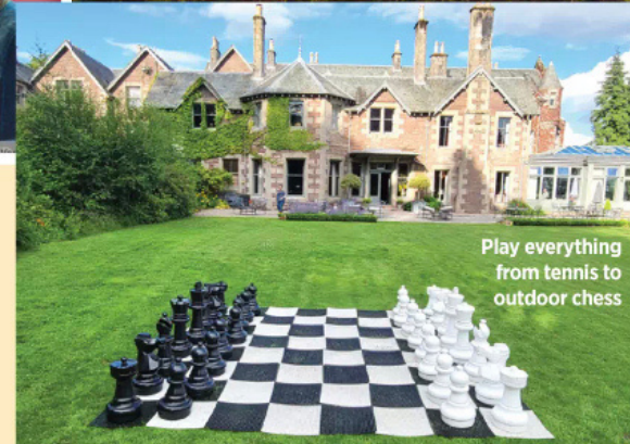
Play everything from tennis to outdoor chess

GET THERE Double rooms at Cromlix ( cromlix.com ) from £315 a night, including breakfast. Little's ( littles.co.uk ) can arrange transfers from Glasgow and Edinburgh airports. Flights with easyJet ( easyjet.com ) from London Gatwick from £16.49pp one way.