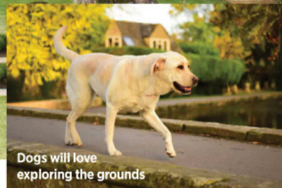
Dogs will love exploring the grounds

created 31 bedrooms, each with a botanical name such as Lemon Balm, Bergamot and Calendula, with design details to match. Garden rooms have a private garden with firepit, glass doors overlooking the patio and freestanding roll-top baths.