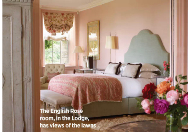
The English Rose room, in the Lodge, has views of the lawns