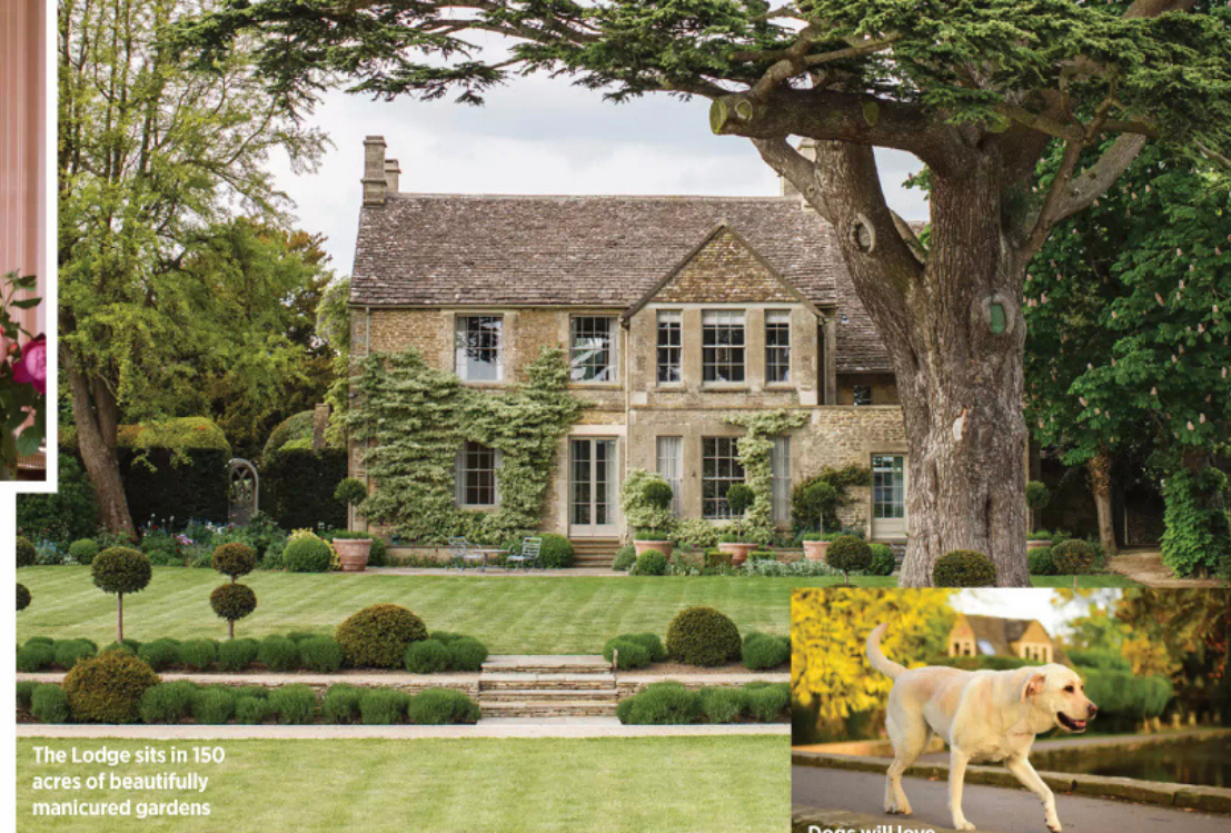
The Lodge sits in 150 acres of beautifully manicured gardens

The 150-acre estate and 17th-century outbuildings have been lovingly restored by the current owners with a focus on nature and seasonal produce. They've