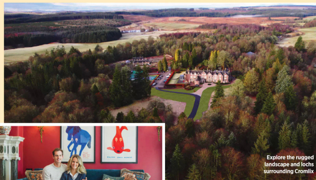
Explore the rugged landscape and lochs surrounding Cromlix

The hotel really is a case of 'love all' and you can even get married in the original chapel. Both Andy and his brother Jamie had their weddings here.