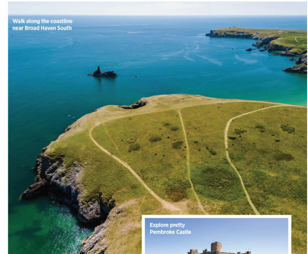
Walk along the coastline near Broad Haven South